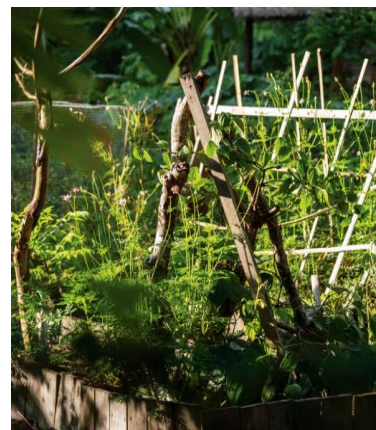
Pictured (l-r): The Lab wall made of upcycled bottles; Upcycling workshop at The Lab; and The Permaculture Garden

Other initiatives under the Youth For The Future pillar include the development of the Eco-Schools Programme in Langkawi island, designed to inform and engage students in respect and appreciation of nature through education and action on environmental issues. The programme is operated under the umbrella of WWF-Malaysia and has been rolled out by WWF in 74 countries and 59,000 schools around the world. In Malaysia, the programme is supported by the Ministry of Education as well as the Ministry of Natural Resources and Environment, and run through The Datai Pledge's NGO partner Green Growth Asia Foundation (GGAF), which aims to champion green projects that drive economic growth through education for sustainable development and social inclusivity. Engagement has already begun with the two schools sponsored by The Datai Pledge.