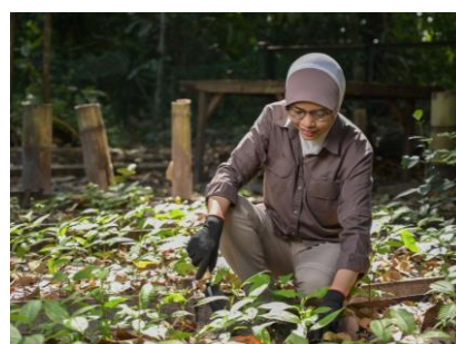
Pictured (l-r): A Great Hornbill at The Datai Langkawi; Dev leading a nature exploration activity; and Native Tree Nursery

2021-22 also saw the introduction of many other new pillar initiatives and projects with new partners, enabling The Datai Langkawi to increase the scale and reach of its objectives and ambitious plans going forward. Goals for 2022-23 include continued measuring of carbon stock as part of the resort's ambition to achieve Carbon Neutral status by 2024, working in collaboration with Universiti Kebangsaan Malaysia; securing permission from the Forestry Department of Langkawi, and confirming project funding to implement the next phase of the 'Corridor for Life' by 2024; expanding its zero-waste-to-landfill operations by integrating The Els Club Teluk Datai and the staff residence into the project; initiating Monoculture Garden crop activity; increasing in-house production of soap, insect repellent, honey and candles; and increasing the frequency of workshops and visits by local artisans and beneficiaries. There are also plans to implement further coral studies throughout the year and expand the natural in-situ Coral Nursery in Datai Bay, whilst improving the local environmental conditions for sea turtles.