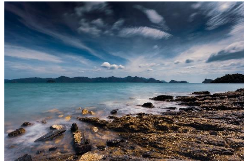
Photographs of the rainforest and ocean on Langkawi island

“I think photography should have a purpose. It must mean something. At some point, it must help with a vision. You have to tell a story, otherwise it becomes just empty, pretty pictures at most. But when you are able to impact another person with the images you take, then I think you are getting somewhere.” - SC Shekar