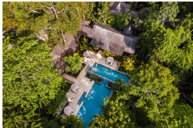
The Datai Estate Villa

Langkawi, Malaysia, June 2019 - Ushering in a new era of first class hospitality, Malaysia's legendary The Datai Langkawi unveils the latest addition to its accommodation offerings, The Datai Estate Villa . A unique and ultra luxurious experience, the expansive five-bedroom villa is one of the largest of its kind in Asia and a true escape to nature, allowing guests to soak in the sensational natural setting of the ancient rainforest from a private veranda, while being just walking distance to the Andaman Sea.