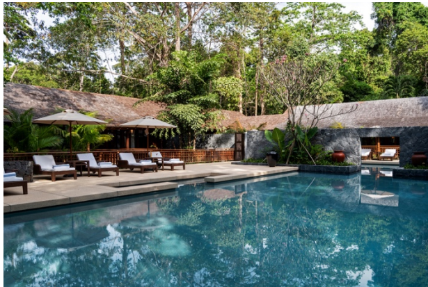
The Datai Estate Villa pools

An expansive five-bedroom villa located in the heart of the ancient Malaysian rainforest and moments away from the award-winning Datai Bay beach