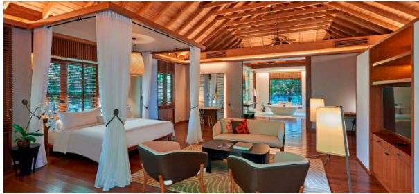
Meranti master bedroom

drinks, beers, spirits and snacks. Exclusive benefits also include daily afternoon tea and an à la carte breakfast served in the comfort of the villa or at the resort's The Beach Club restaurant located just moments away from the villa. Perfect for creating meaningful shared moments for large families or groups of friends, The Datai Estate Villa can be booked in its entirety or separately as the three-bedroom Meranti villa accommodating up to eight adults or as the two-bedroom Seraya villa for six adults.